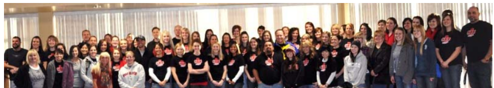
Nursing Students – Opening Celebration, January 2010

The level four class of Spring 2010 would like to thank all of the faculty and staff for their time and dedication. Thank you for sharing with us your knowledge, experience and passion. We hope to make you proud as both SUU Nursing Graduates and professional nurses!