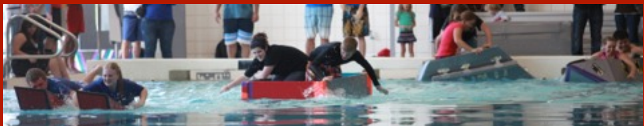
The always popular Cardboard Boat Race was held during Homecoming and again during Technology Fair 2012.